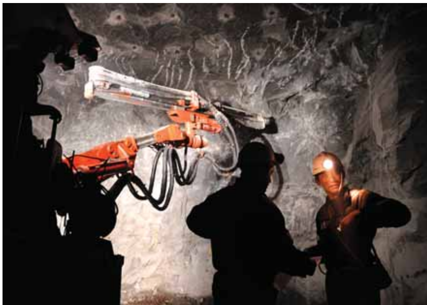
Kazakhmys South mine Zhezkazgan complex.

more than $1,300 this year. Kazakhstan has not been excluded from the resultant gold rush seen throughout the world's gold rich regions.