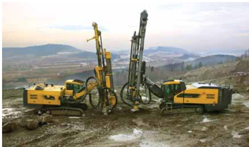
Blasthole drilling in Kazakhstan with Atlas Copco ROC L6 drills.