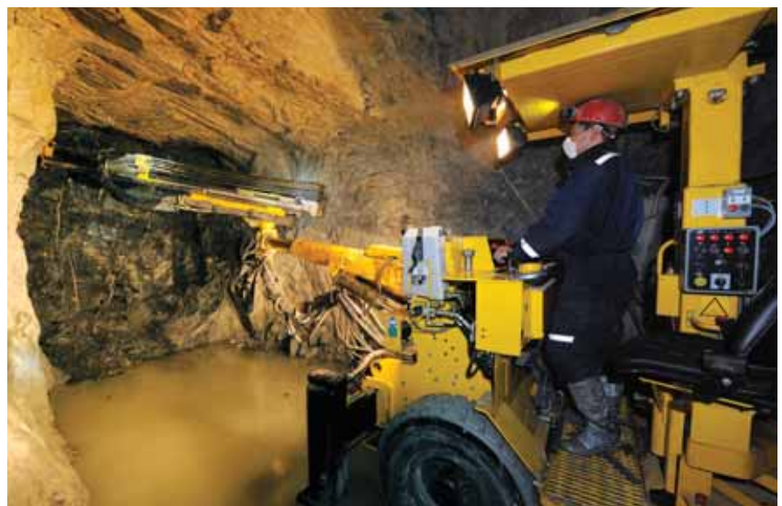
Jumbo drill at Kazzinc, a major fully integrated zinc producer with considerable copper, precious metals and lead credits. The company's core operations are in Kazakhstan, mainly in East-Kazakhstan Region. It employs more than 22,000 people in mining, ore dressing, metallurgy, power generation and mechanical production.

Kazakhstan's equipment supply market is pervaded by a division in management and procurement perspectives between the incumbent short term purchases of cheap Russian or Chinese equipment and the more conventional international approach of investing more on capital expenditures over the course of production life cycles. As the Kazakh mining industry's presence on global stock markets continues to increase, so does the requirement for world class equipment standards. Within this context, the market is beginning to see a shift away from traditional Soviet era procurement strategies toward one more concerned with long term productivity and efficiency; predominantly at the behest of the international investment community. Such a cultural shift within the local market combined with ambitious national production targets present a significant range of opportunities for international suppliers not yet established, or exporting into the Kazakh market place.