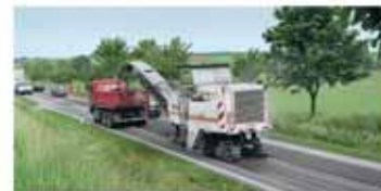
Wirtgen's largest mills are capable of both accurate layer cutting and pavement removing on its entire depth.