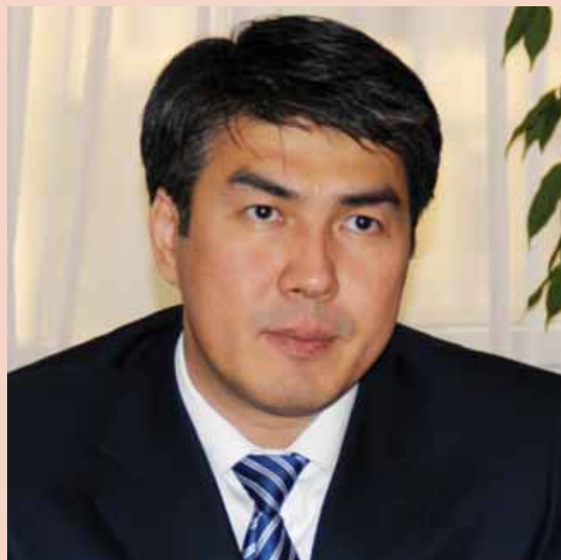
The Hon. Minister Asset Issekeshov—Minister of Industry and New Technology, now separated from the oil and gas.

The Ministry of Industry and New Technologies undertakes measures against bureaucracy and corruption. The Ministry methodically works on unifying licensing legislation, reducing timeframes for consideration of applications for geological survey, mining and development of reserves, and also on reducing the list of activities subject to licensing.