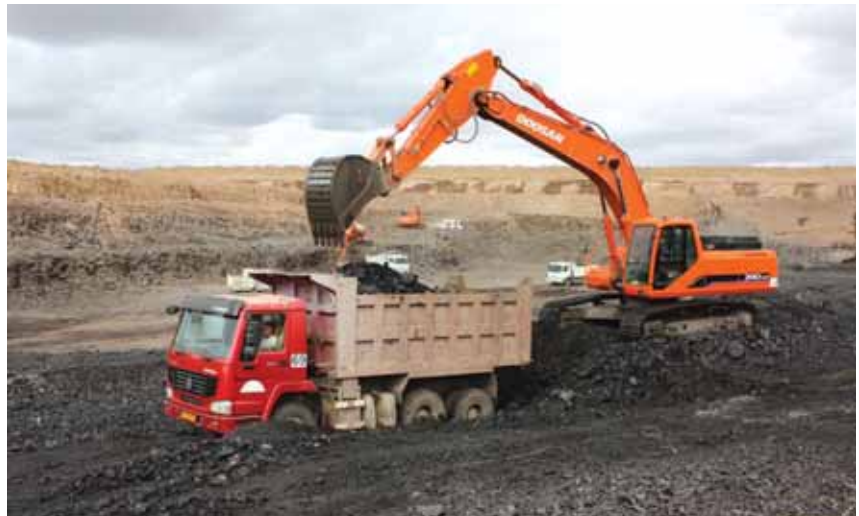
Saryarka—loading coal from mine into haul truck.