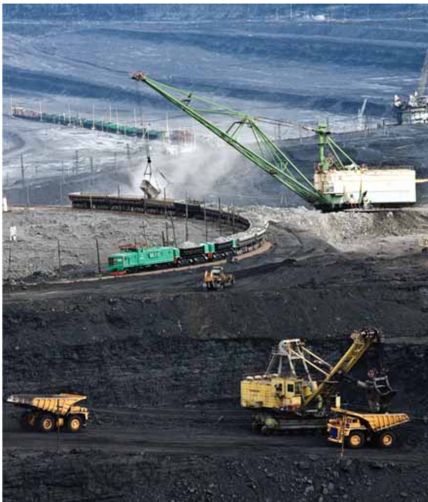
Bogatyr Komir—pit dragline loads overburden into railcars.

It is rather early to understand what the precise implications of the July changes to the Sub soil Usage Act will be, however some initial positive and negative outcomes for mining companies and investors can be noted. The changes have brought a great deal more clarity with regards to the processes and procedures for transfer of usage rights between different private entities, as well as the Kazakh state. This increase in detail is envisioned to reduce the arbitrary nature within which decisions are taken and laws interpreted at a state level. The Sub soil Usage Act 2010 also provides clearer information with regards to exactly which documents are required to be held and submitted by mining firms at various times throughout their project life cycles. Some of the more negative interpretations with regards to recent changes concern the stability regime for laws enshrined in sub soil usage contracts, as well as the ability of statutory governing bodies to unilaterally terminate contracts in the cases of two violations of the contractual agreement in question. The Previous Sub soil Usage Act required substantial violations of obligations under said contract prior to any unilateral termination. In effect, recent changes have made it easier for state authorities to cancel sub soil usage con-