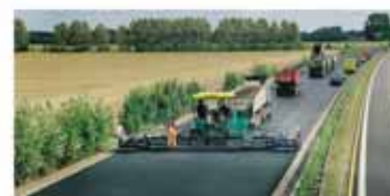
Super 2100 is standing out for its modern concept on utilization comfortability and ease of maintenance.