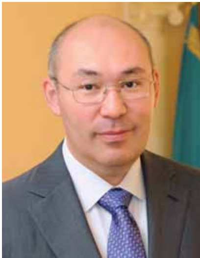
Kairat Kelimbetov—CEO of Samruk-Kazyna, Wealth Sovereign Fund of Kazakhstan.

Kazzinc is Kazakhstan's second largest copper producer with approximately 60,000 mt production in 2009. The Maleevsky underground mine in Eastern Kazakhstan represents approximately 85% of Kazzinc's total copper output. Kazzinc is making a US$700 million investment in copper smelting facilities. "The policy of