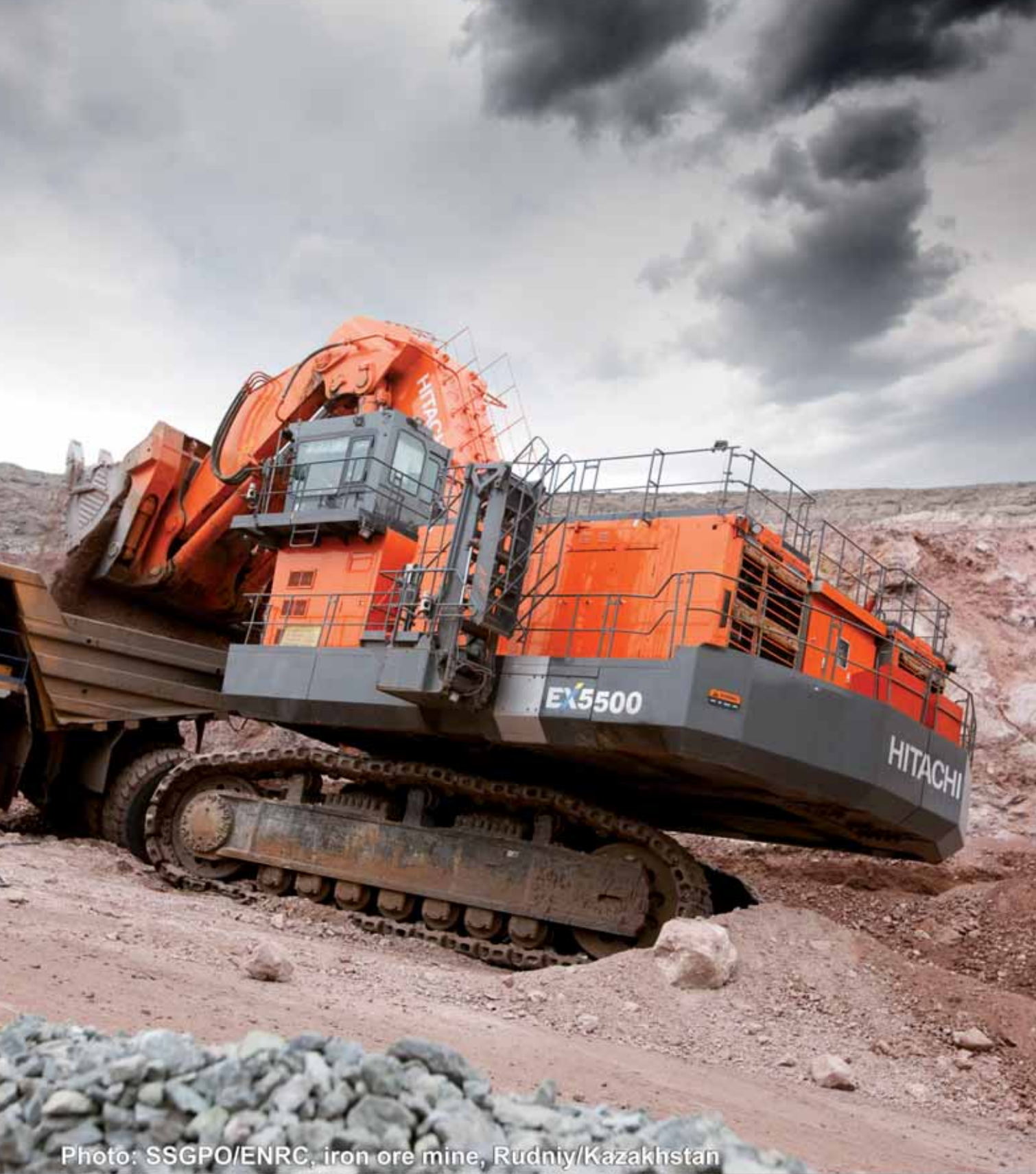
iron ore mine, Rudniy/Kazakhstan

TURKUAZ MACHINERY "MORE THAN THE MACHINE"