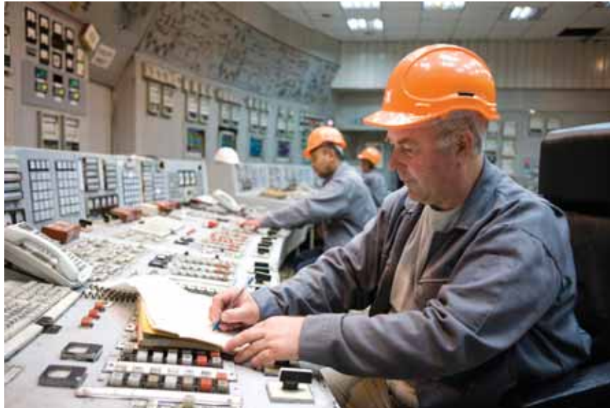
ENRC-central maintenance control room at EEC, Aksu.

A number of smaller scale equipment intermediaries such as Prolog Central Asia, Gateway Ventures, LSH International, Mining & Drilling Services and Kazakhstan Mining & Industrial Financial Co. (KMIF) have emerged that are able to offer more flexible options to their customer base, and a less bureaucratic means of delivering equipment than some of the larger international companies operating in Kazakhstan. "The Central Asian region is going to be one that will be growing very strongly in the coming years. Prolog's range of product and service offerings is extremely well positioned in order to benefit from such growth in the mining industry here. We have set out our stall here in Kazakhstan for Prolog to be considered the portal of choice for international companies entering the Kazakh mining market. Prolog has three clear business streams," said Brodie. "First, we offer a range of business support and consulting services for a whole range of supply related issues such as contracting, tendering, IPO related sign offs and logistics consulting. Our second stream Prolog works with is our representation and