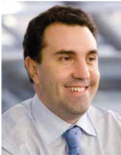
Oleg Novachuk—CEO of Kazakhmys, one of the two FTSE 100 Kazakh Mining companies.

smelting and refining complexes, Kazakhmys produced 320,000 mt of copper in 2009, representing around 80% of Kazakhstan's total output for that year. Kazakhmys' strategic objectives in Kazakhstan are focused upon new constructions of processing plants as well as the upgrade of existing facilities and the continued expansion of output with mine developments such as Bozshakol and Aktogay projects that will come into production in 2014 and 2015 respectively. "The main thing to note about Kazakhmys is it has developed as an integrated company—more so than most other copper miners around the world," said Oleg Novachuk, Kazakhmys CEO. "All of our ore is processed through to finished metal, which allows us to capture more value and makes us less vulnerable to external shocks. And for us, being integrated includes running our own coalfields and power stations, so that we are not dependent on others for our power. Security of power supply is going to be even more important in the future."