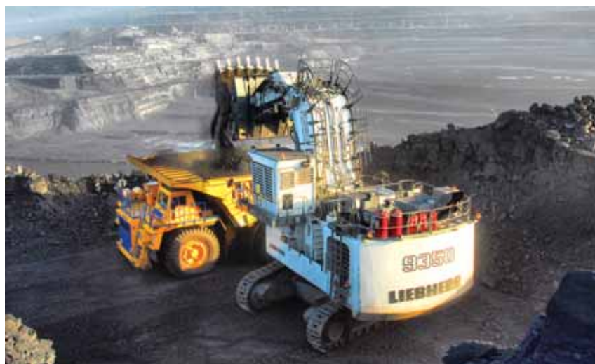
Liebherr equipment, part of the renewing project the company is currently undertaking, a commitment to use top-notch technology for increased productivity.

Looking forward, the trend of reform is increasingly looking at a more progressive taxation and royalties regime, whereby fixed taxes drop over time, however royalties related to output increase in line with global commodities prices. Corporate income tax rates will drop from 20% in 2009 to 15% in 2011. Concurrently a new royalties' regime will be introduced called the Mineral Extraction Tax, whereby payments will be calculated according to what particular mineral is being extracted and its market price at the time. It is expected the MET will increase the overall royalties' burden for mining companies operating in Kazakhstan. It is important to note however, Kazakhstan's tax regime for the mining industry is increasing from what would be