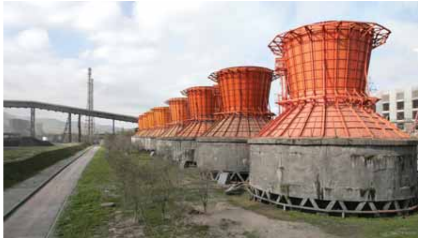
Kazphosphate—state of the art production facilities.

best summarizes the phosphate markets turbulent past and positive outlook within the context of the company. “On the basis of existing mines and plants, Kazphosphate was established in 1999. Now we have two main mining complexes in Karatau and Zhanata city. We have six mines overall, two underground and four open-pit mines. Our estimates show that we have approximately 1.9 billion mt of phosphate in these mines, but overall the phosphate amount in the