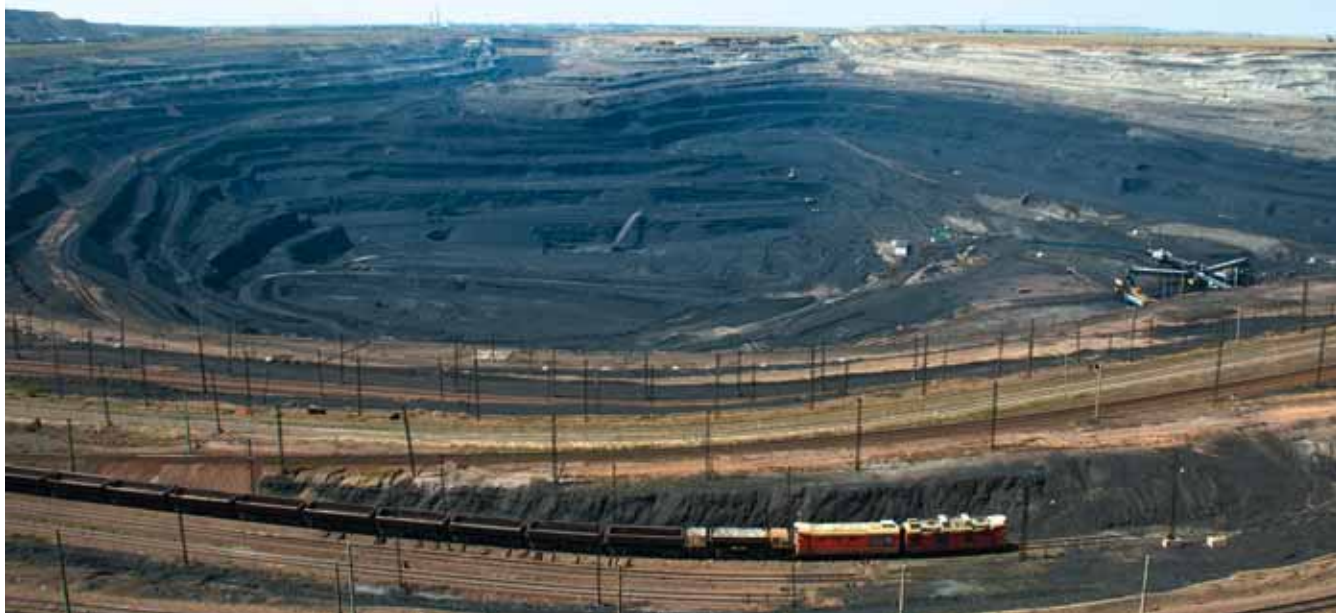
Bogatyr Komir—open-pit coal mine in Ekibastuz, Kazakhstan.

At the summit of Central Asia, straddling regional superpowers Russia and China to the north and east respectively, sits the vast and resource rich nation of Kazakhstan. Despite Kazakhstan's mining industry suffering a significant retrenchment in both investment activity and production output throughout the global financial crisis' most acute period in 2009, the mining sector is now forecast to enjoy high rates of sustained growth over the short to medium term.