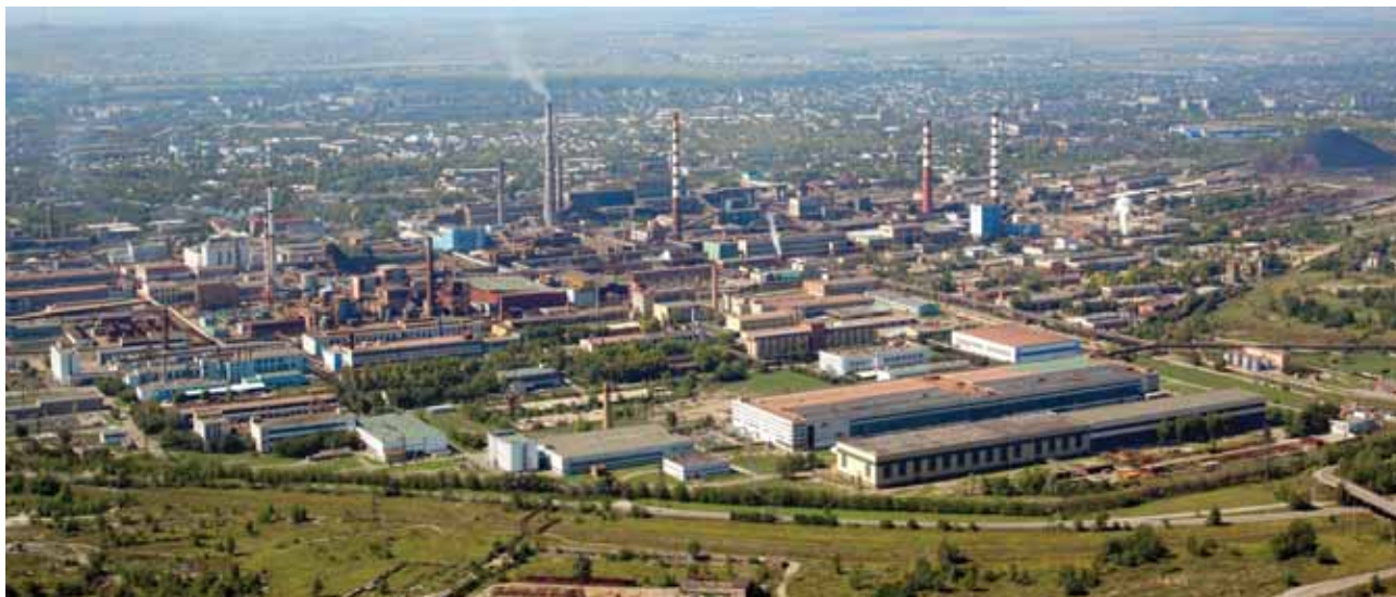
The Ulba Metallurgical Plant Joint-Stock Company is engaged in production of hi-tech uranium, beryllium and tantalum products, for the needs of the nuclear power industry. One of the leaders of the world, a unique facility with decades of tradition in Kazakhstan. Located in Ust-Kamenogorsk, one of the Kazatomprom facilities.

Kazakhstan's total assured uranium resource equates to approximately 1.6 million metric tons (mt), giving Kazakhstan the second richest uranium reserve in the world after Australia. It is generally agreed these 1.6 million mt are concentrated in six uranium rich provinces. Just three of these regions are currently engaged in production, predominantly using the in-situ leaching method, however with a small proportion of shaft mining also in place. The Shu-Sarysu province in South Central Kazakhstan accounts for 60.5% of Kazakhstan's uranium reserves, with key mining activities taking place at the Uvanas, Mynkuduk, Kanzhugan, Moinkum, Akdala, Buddenovskoye and Inkai mines. All mining operations in Shu Sarysu province employ the in-situ leaching methodology of uranium extraction. The Northern Kazakhstan province that encircles Astana represents 16.5% of Kazakhstan's total uranium reserves, with key mining operations taking place at the Vostok deposit. Shaft mining methods alone account for production at Vostok. Syrdarya province in Kazakhstan's deep-south represents 12.4% of Kazakhstan's total uranium resources, major mining operations currently underway are at Northern and Southern Karamurun, Irkol and Khorassan. In-situ leaching is the pre-