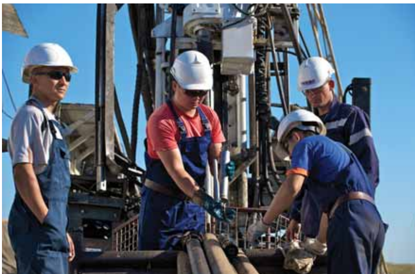
AIDD (Australasian Independent Diamond Drilling) working on drilling operations at Bakyrchik project, a large underground gold resource, 70% owned by AltynAlmas. Total measured, indicated and inferred resource, indicates 62.5 million mt at 6.6 grams/mt gold based on a 3 g/mt gold cut-off.

As uncertainty in the global economy continues to linger and gold prices continue to break records, the world's relatively untapped gold mining regions such as Kazakhstan have become of increasing interest. NYMEX gold prices have increased by almost 500% since 2000, from $250 to