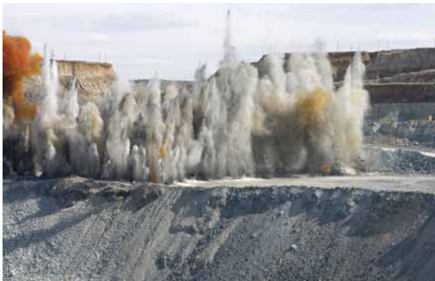
ENRC—Controlled explosions at Donskoi GOK, Kazchrome, Khromtau.

tracts for minor infringements. The scope of the stability regime has been narrowed, excluding both tax and customs regulations on top of previously excluded environment, national security and health and safety legislation. As a result, agreements enshrined in signed contracts are subject to changes in Kazakh law, thus creating confusion and unpredictability for business models liable to changes in the broader legal environment.