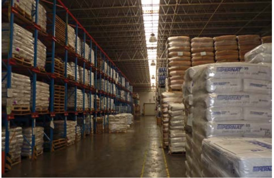
Internal picture of a portion of Evonik's warehouse operation.