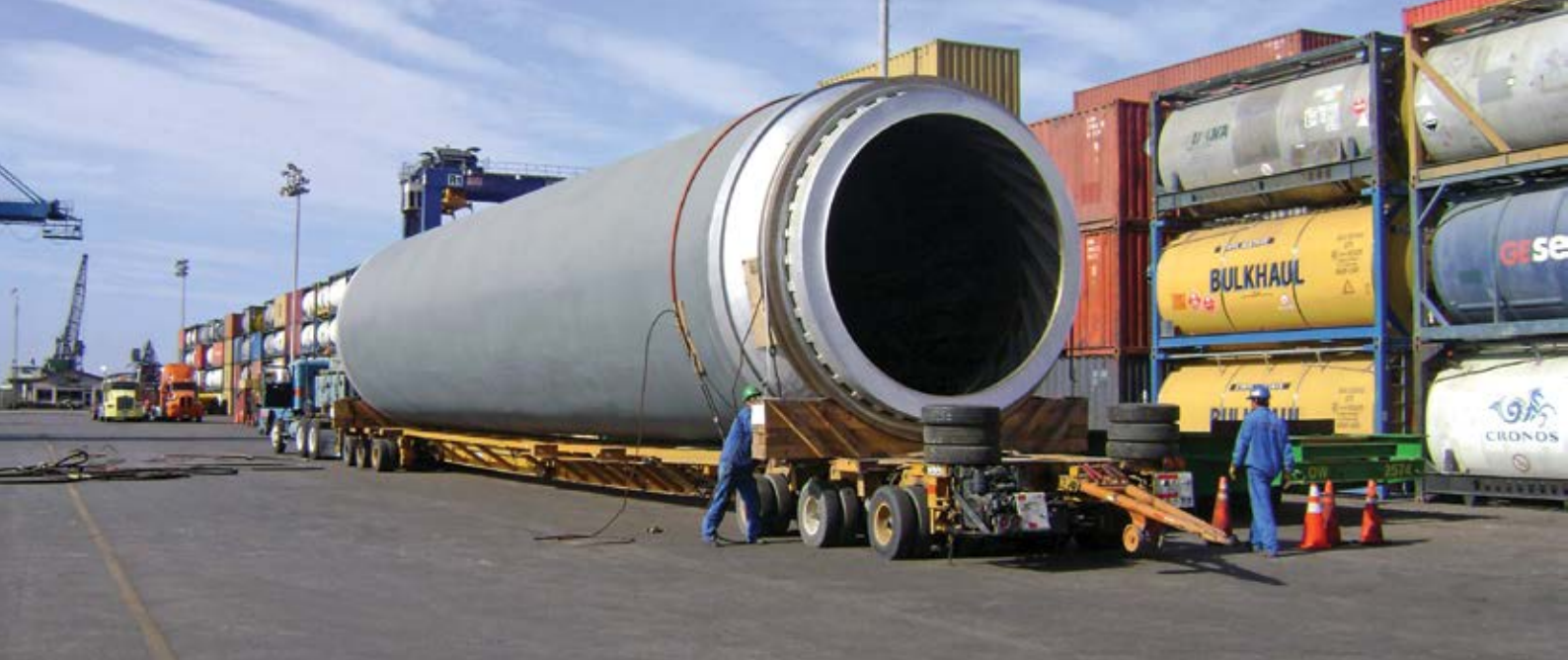
Cargo Group International's operations team moving a tank from Altamira to Navolato, Sinaloa.