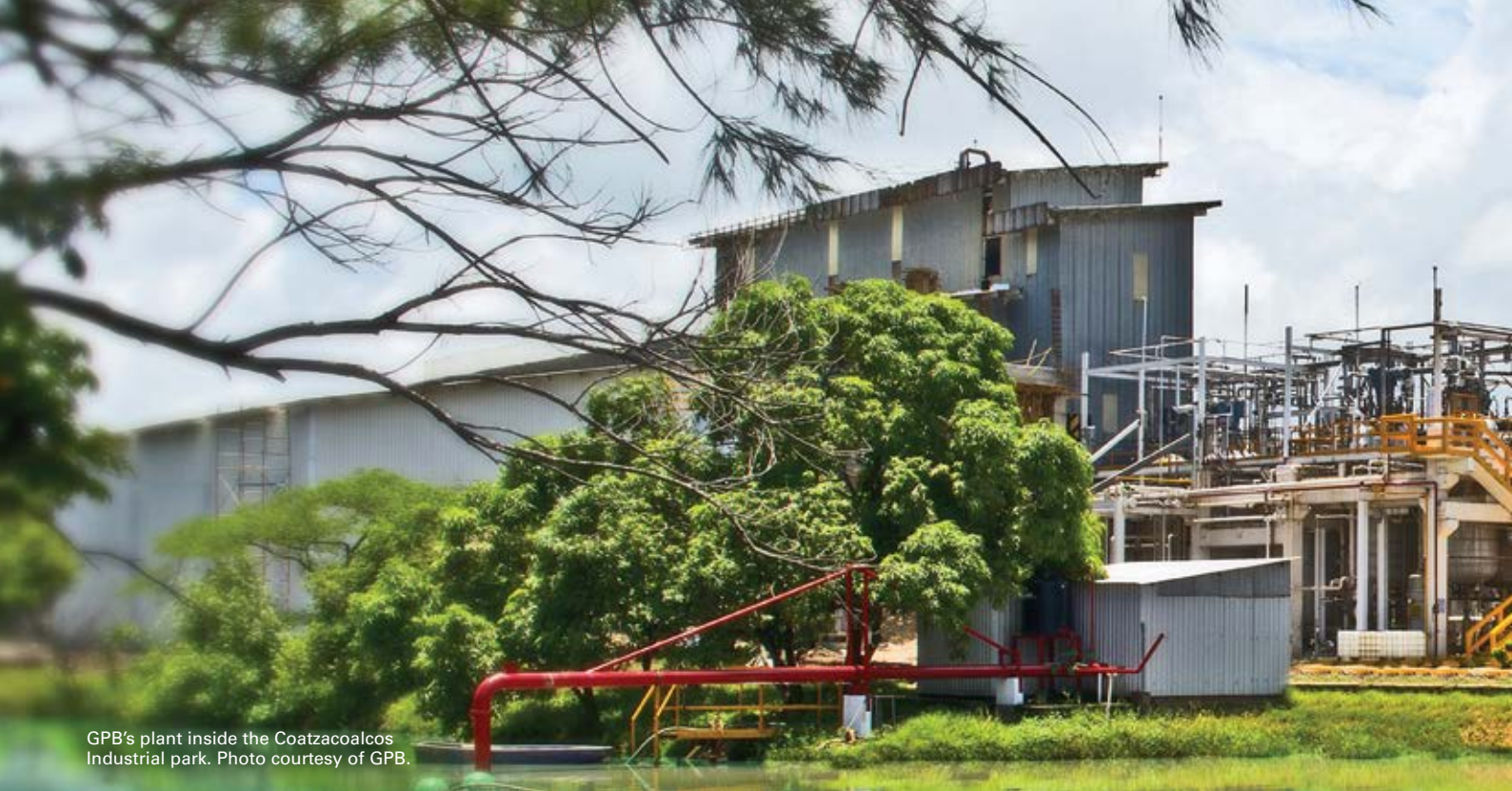
GPB's plant inside the Coatzacoalcos Industrial park.