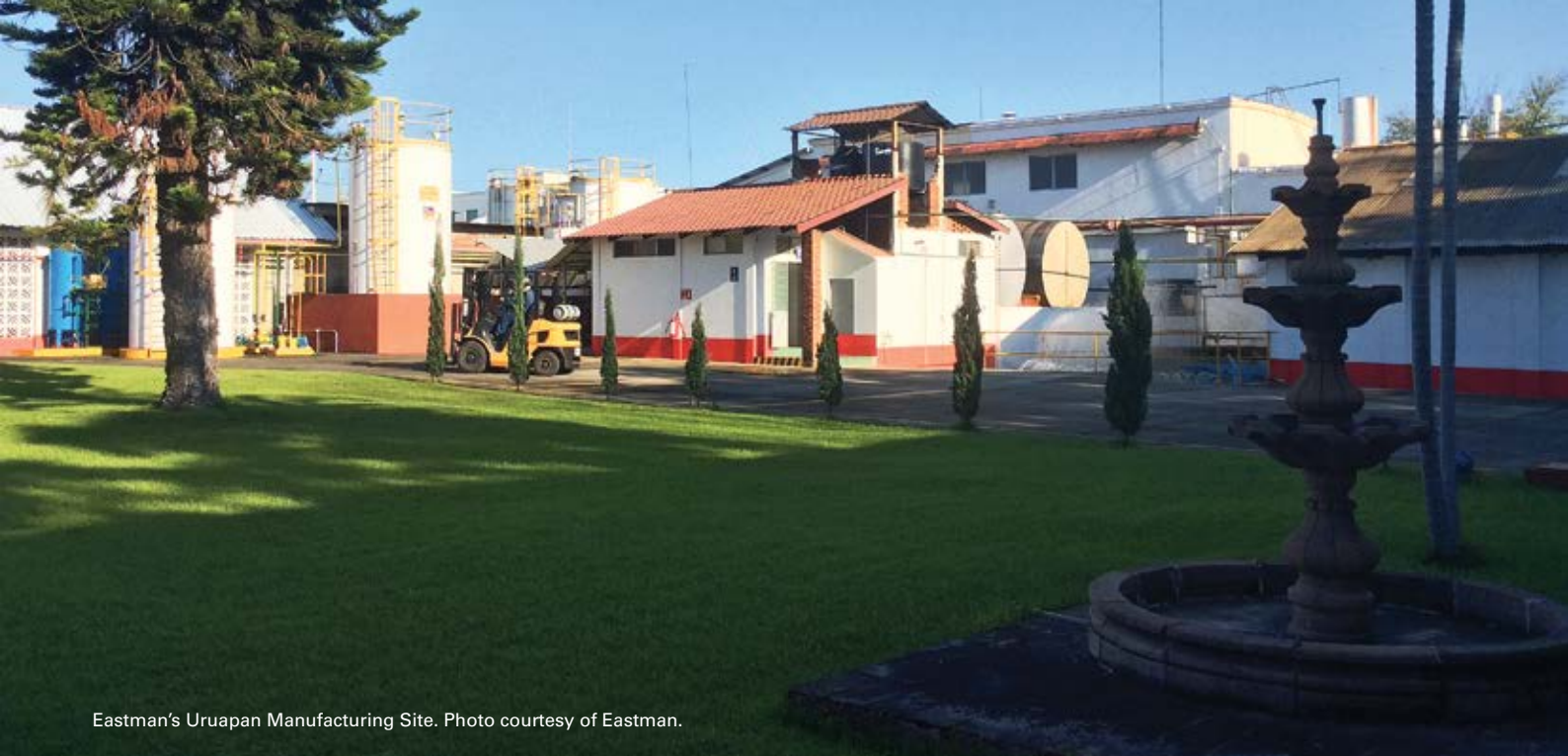
Eastman's Uruapan Manufacturing Site.

diversified markets that we work in, with a key focus on the automotive sector, building and construction and industrial intermediates." Global specialties company Evonik has manufactured chemicals in Mexico since 1968 and expects manufacturing to remain the company's main focus in Mexico in spite of the expected changes coming to the market. "The Mexican population will have more buying power and will consist of a larger middle class that is able to afford higher value products. These shifts in the market will lead to more opportunity for Evonik requiring more specialty chemicals and products," said Bachmann of Evonik Mexico.