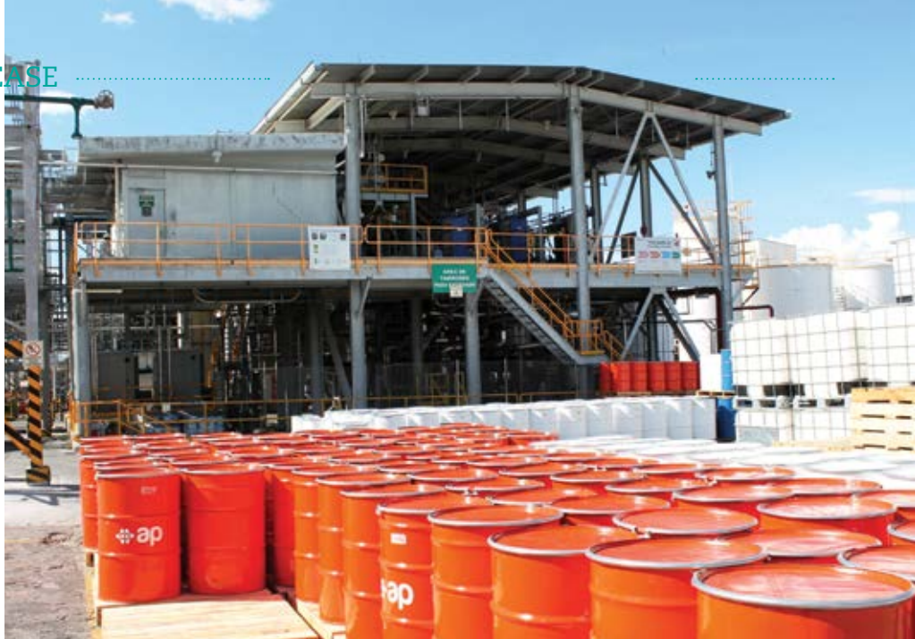
AP plant located in Queretaro, Mexico which develops high quality water and solvent based products.

Comex has proved an attractive target, as a