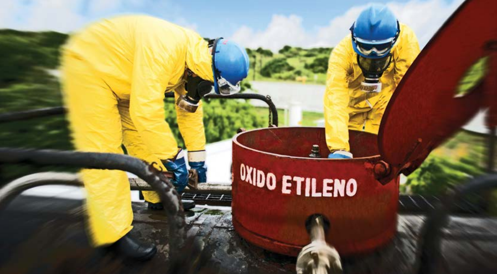
GPB's Investigation and Development staff is a team with wide experience on etoxilation and propoxilation processes development; they have created innovative technologies for the production of Hydroxyethylcellulose, synthetic lubricants, and polyalquilenglycols of high molecular weight.