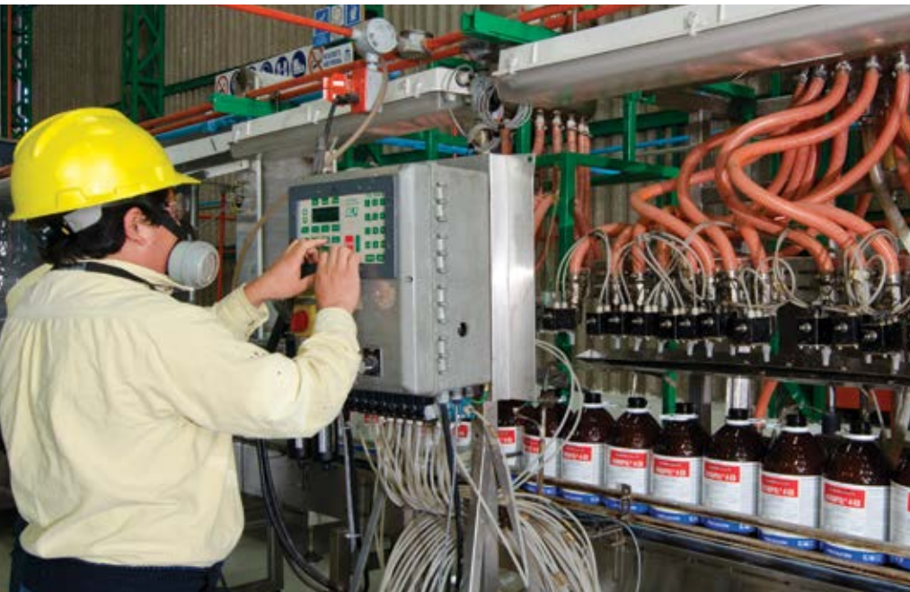
Chemical synthesis and blending manufacturing capabilities at Grupo Polak’s Tlaxcala facilities.

In this context, competitive reindustrialization is a top priority for the industry. “There is a list of about 3,000 products that are no longer manufactured in Mexico and we need to bring them back to the country,” said Ortiz of CANACINTRA.